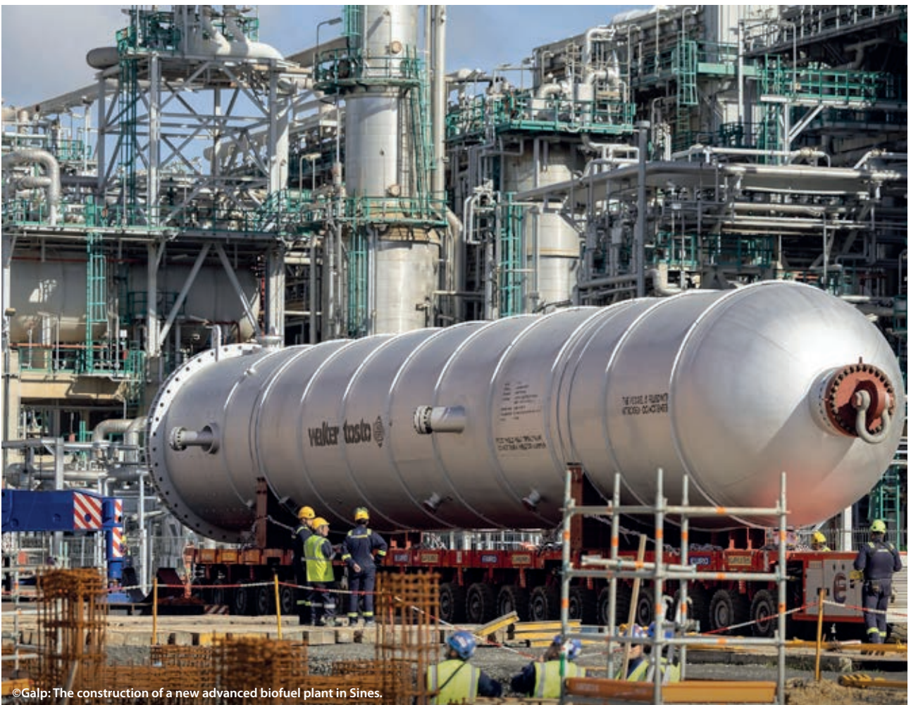
The construction of a new advanced biofuel plant in Sines.