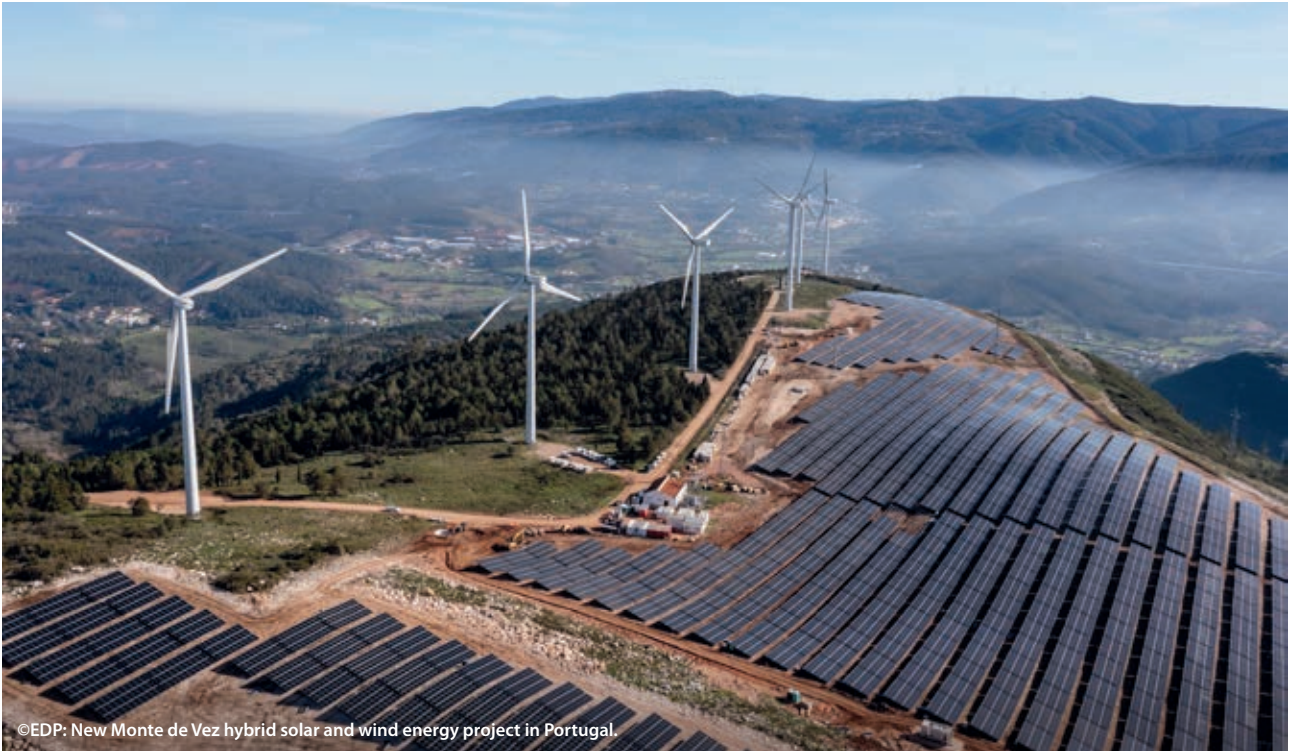
New Monte de Vez hybrid solar and wind energy project in Portugal.