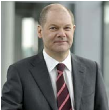
Olaf Scholz Mayor of Hamburg Germany