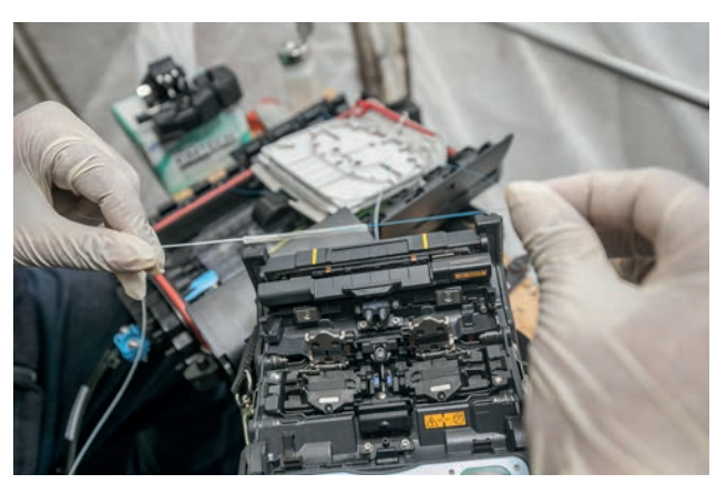
Expansion of the promoter's open access fibre optic network in Ireland

A Portfolio Risk-Sharing Loan financial instrument with total funding of €94 million made available by the Romanian authorities from their Rural Development Programme. It is expected to result in a portfolio of new loans of up to €126 million for at least 350 farmers and agricultural SMEs. The measures covered by the instrument include investments in physical assets