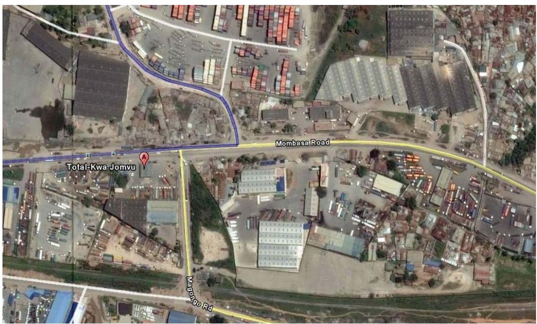
Figure 1.1: The Eviction Area