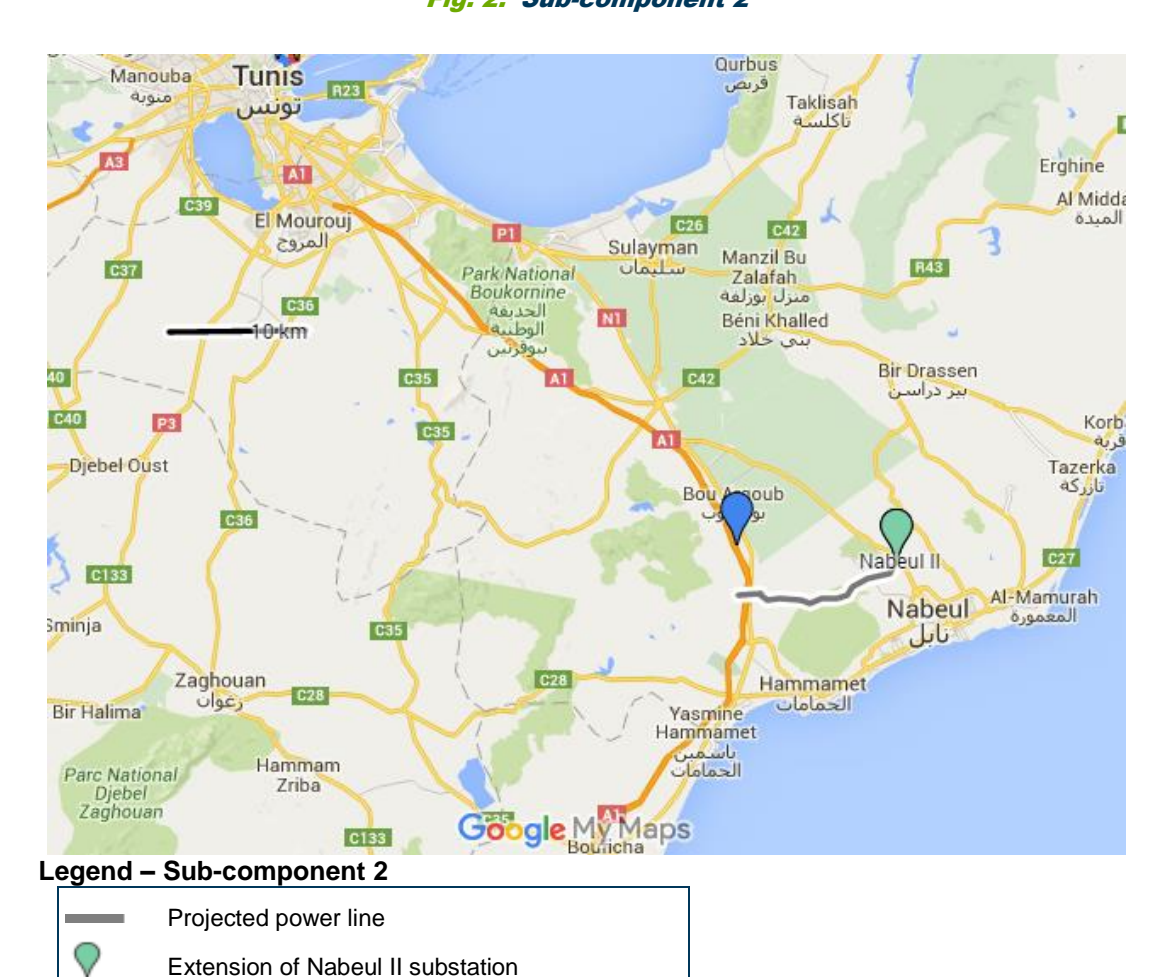
Fig. 2. Sub-component 2

The sub-component is located near Nabeul and Hammamet in Nabeul governorate.