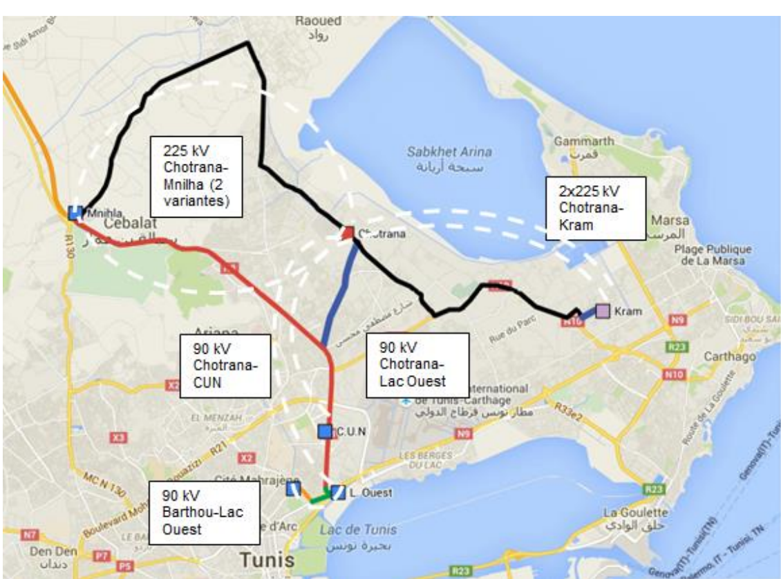
Fig. 1. Sub-component 1