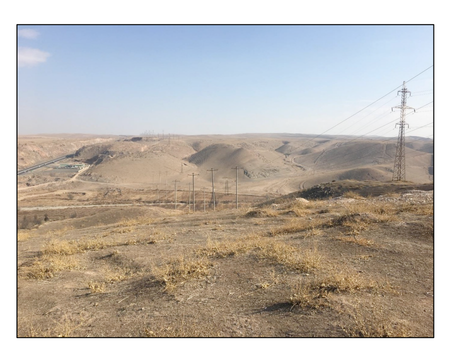
Plate 2. View across to the foothills for the Overhead Line between the Sanzar river valley and the existing Saribazar substation

Habitat typical of the Overhead Line are shown in Plate 2 .