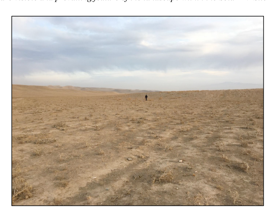
Plate 1. Fallow formerly cultivated land, the prevailing habitat type in the Solar PV Site. Historic plough-lines are visible and prevailing feature of the landscape within the Solar PV Site

The Overhead Line route crosses intensively cultivated and irrigated farmland habitat between the proposed Solar PV Site and the Sanzar river valley/Tashkent-Samarkand highway. To the south-east of the Sanzar River crossing, the Overhead Line traverses low lying foothills for approximately 1.5km