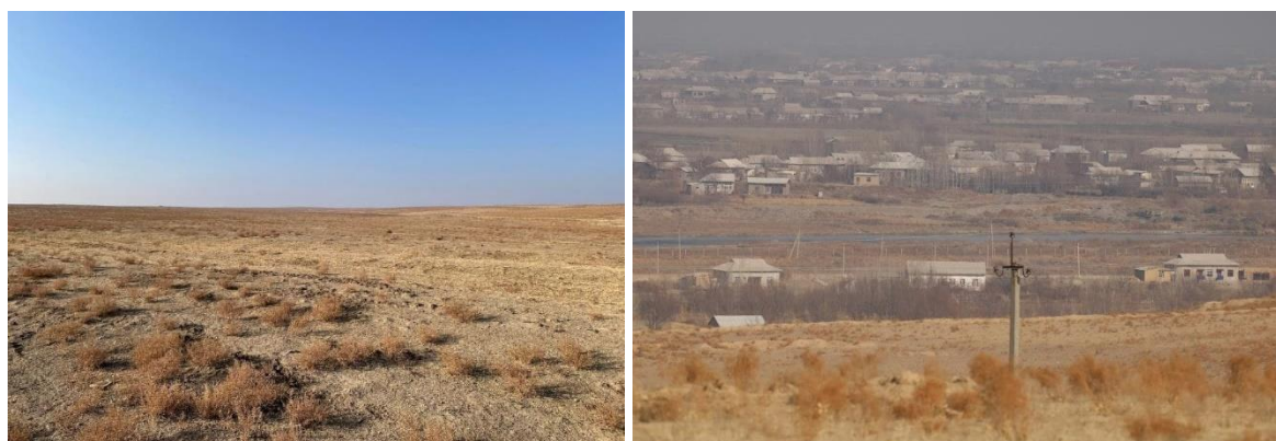
Figure 2-1. View to the centre of the site (Left) and Zarafshan river to the north of the site (Right)