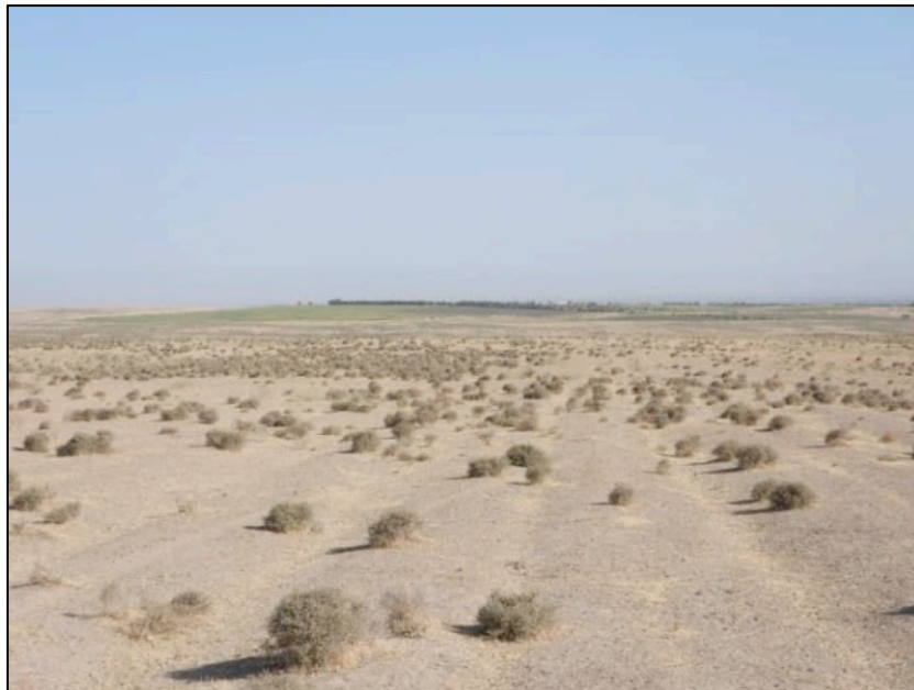
Plate 1. The prevailing agro-landscape (ridge and furrow) with associated ruderal weed flora assemblage within the Solar PV site

The proposed Overhead Line is routed through a generally flat, intensively cultivated and irrigated agricultural landscape, with field crops including cotton