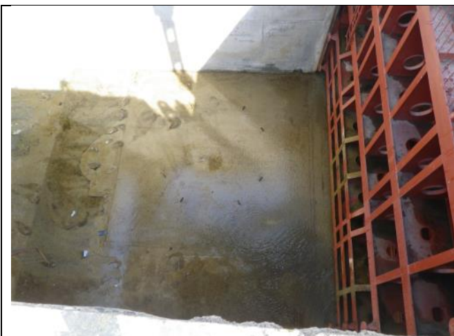
Picture 9 – The concrete dam below the sluice gate will need to be lifted up in order to access and replace the generator and turbines.