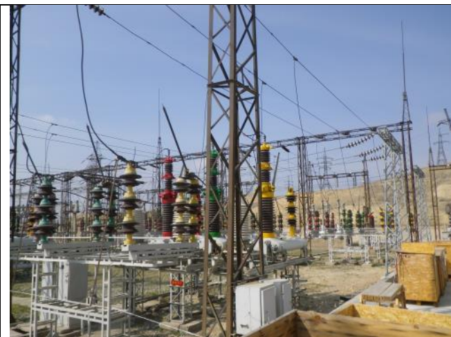
Picture 4 – This part of the switchyard will be dismantled and will receive the new transformers.