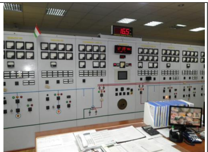
Picture 10 – Control rooms, generators, turbines, electrical equipment – all will be replaced.