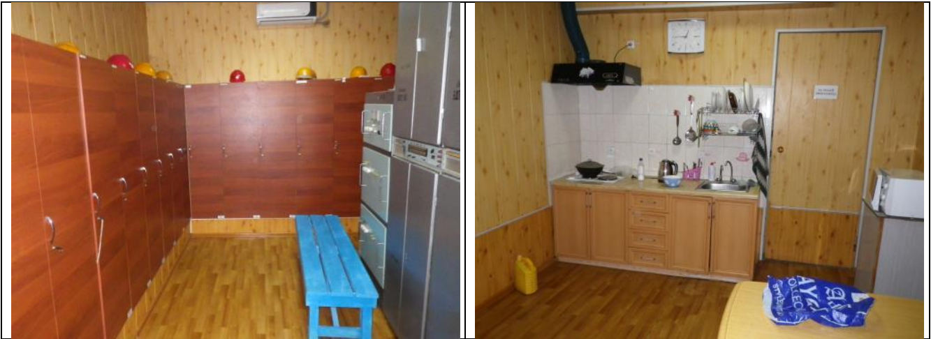
Picture 12 – There is an obvious effort made to ensure the well-being of workers. Here the control room workers locker room and kitchen.