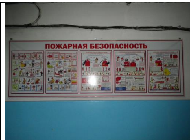
Picture 11 – Safety instructions and signs are frequent and appropriately distributed.