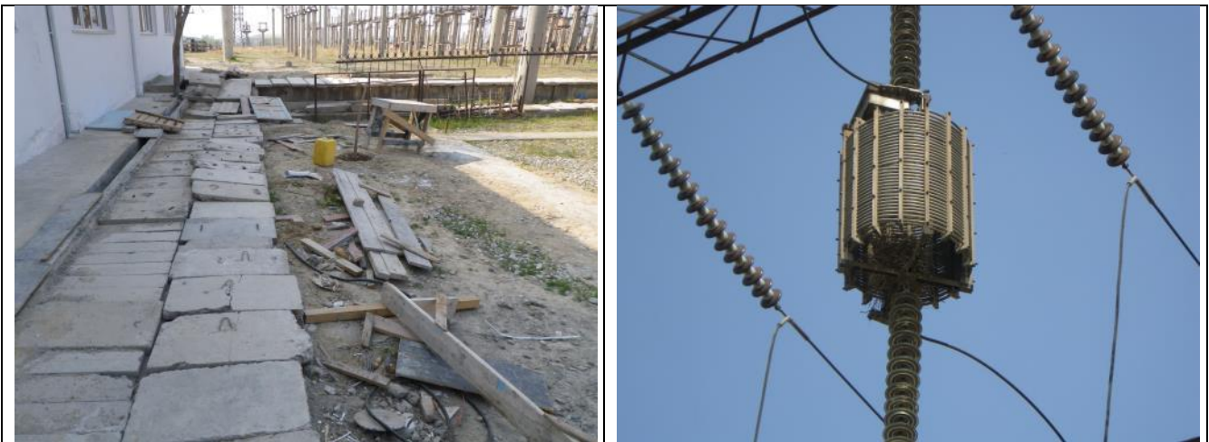
Picture 13 – resurfacing is needed in several places at the switchyard.