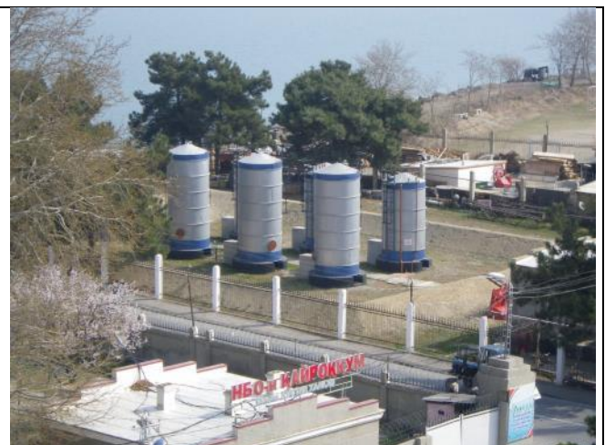
Picture 6 – Mechanical oil storage. Containments (in case of leak) are located under the tanks. The earth dike around the storage is there to be pushed to the bottom of the tanks in case of fire.