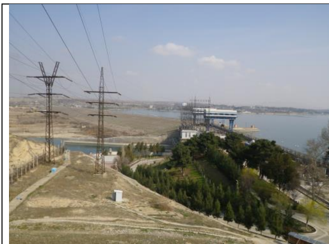
Picture 5 – Overall view on the hydropower plant and on the earth dam.

The following pictures illustrate the observations made during the 2015 visit: