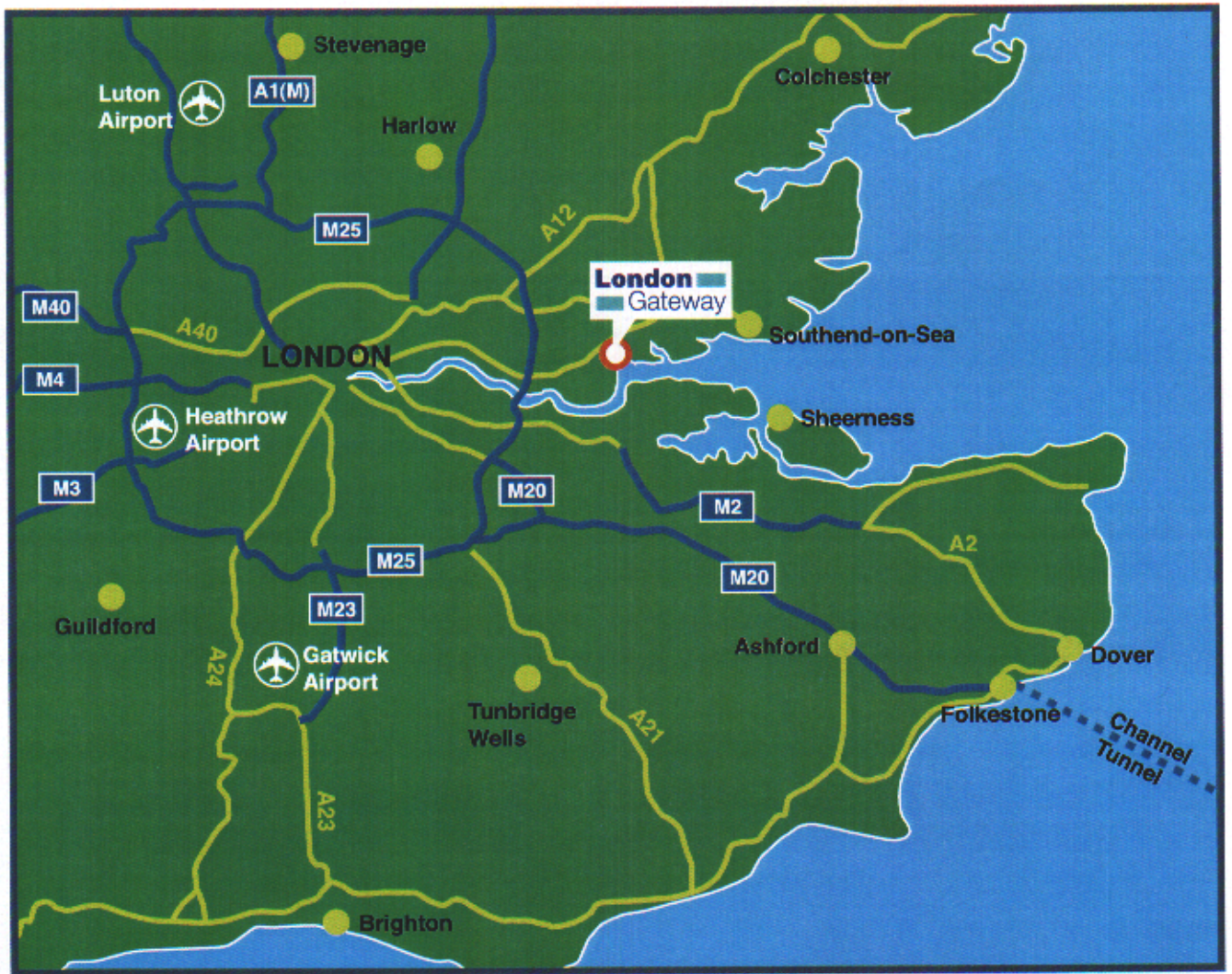
General site location