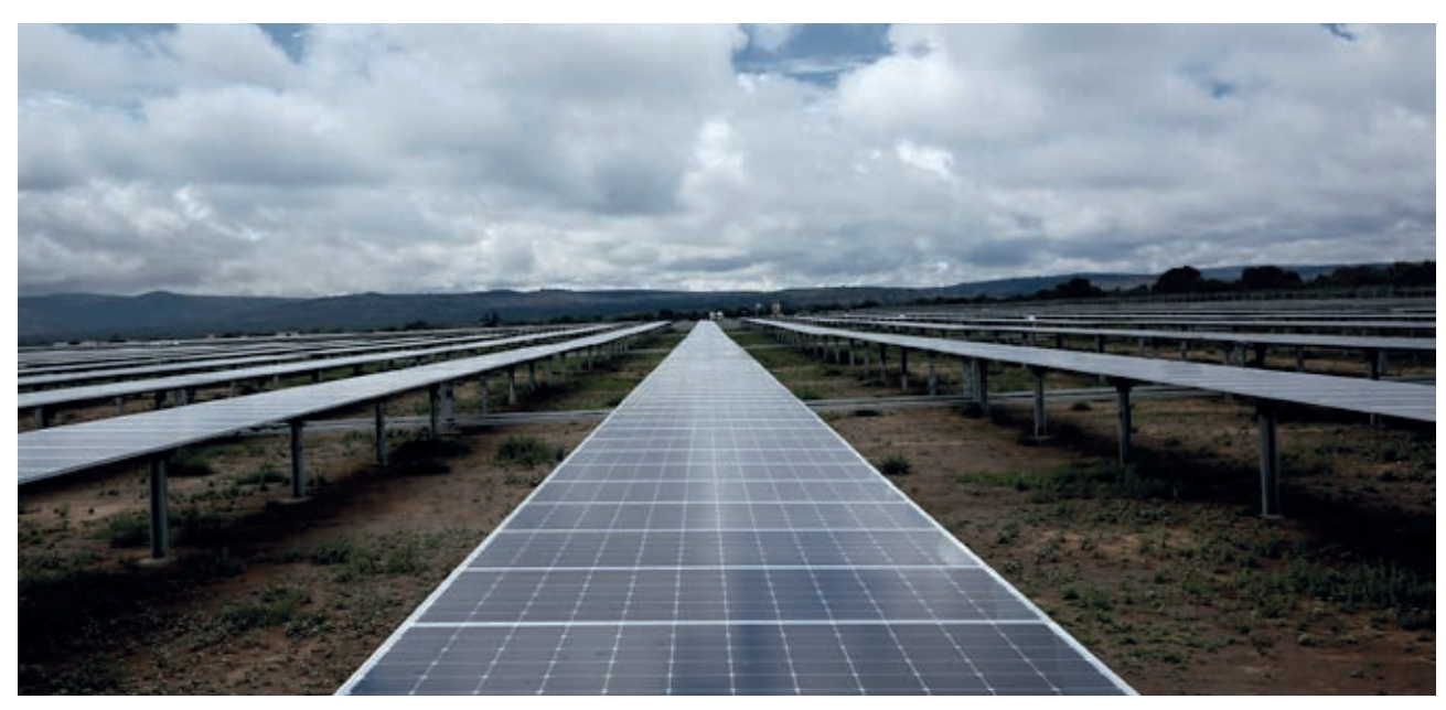
Iberdrola and the European Investment Bank sign a €70 million green loan agreement to boost renewable energy in Portugal

The financing will go to the following projects: Montechoro I and II (37 MWp), Alcochete I and II (46 MWp), Algeruz II (27 MWp), Conde (14 MWp) and Carregado (64 MWp). The financing will also include ancillary infrastructure such as access roads, substations and interconnections. The investments will boost economic growth and employment in these regions. Overall, the new infrastructure will create around 1 000 direct jobs during the construction phase, in addition to those generated in the wider supply chain.