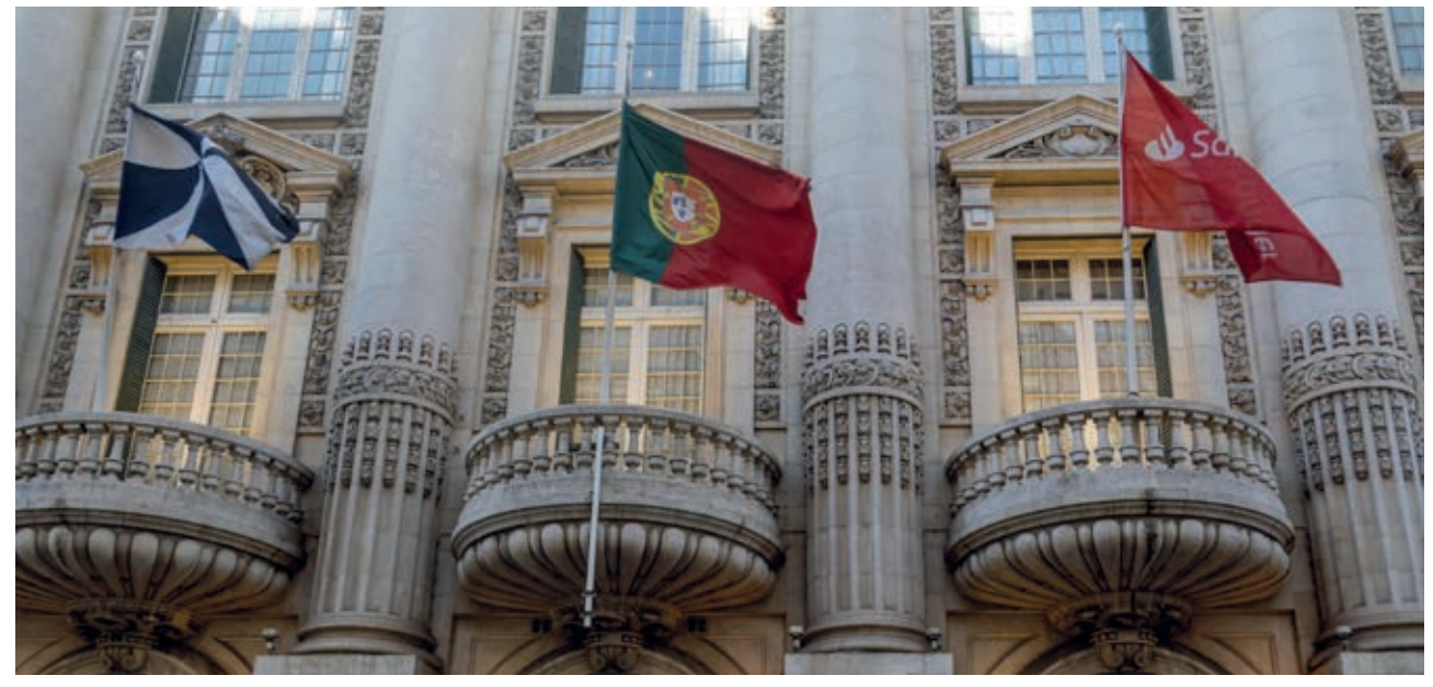
The EIB and Santander Portugal are providing €820 million for small and medium-sized Portuguese businesses.

The European Investment Bank and Banco Santander Portugal signed an agreement in 2022 to support small and medium enterprises and mid-caps in Portugal with a total investment package of €820 million. This agreement will provide more loans to these companies, especially those operating in less developed regions, supporting over 3 000 businesses. The EIB funds will be made available to Santander via a true-sale ABS structure (backed by a portfolio of consumer finance loans). The agreement increases the financing available to small and medium businesses and midcaps as the economy recovers from the impact of the coronavirus pandemic, the high energy costs, and rising inflation stemming from macroeconomic impacts of the war in Ukraine that continues to put Portuguese companies under stress.