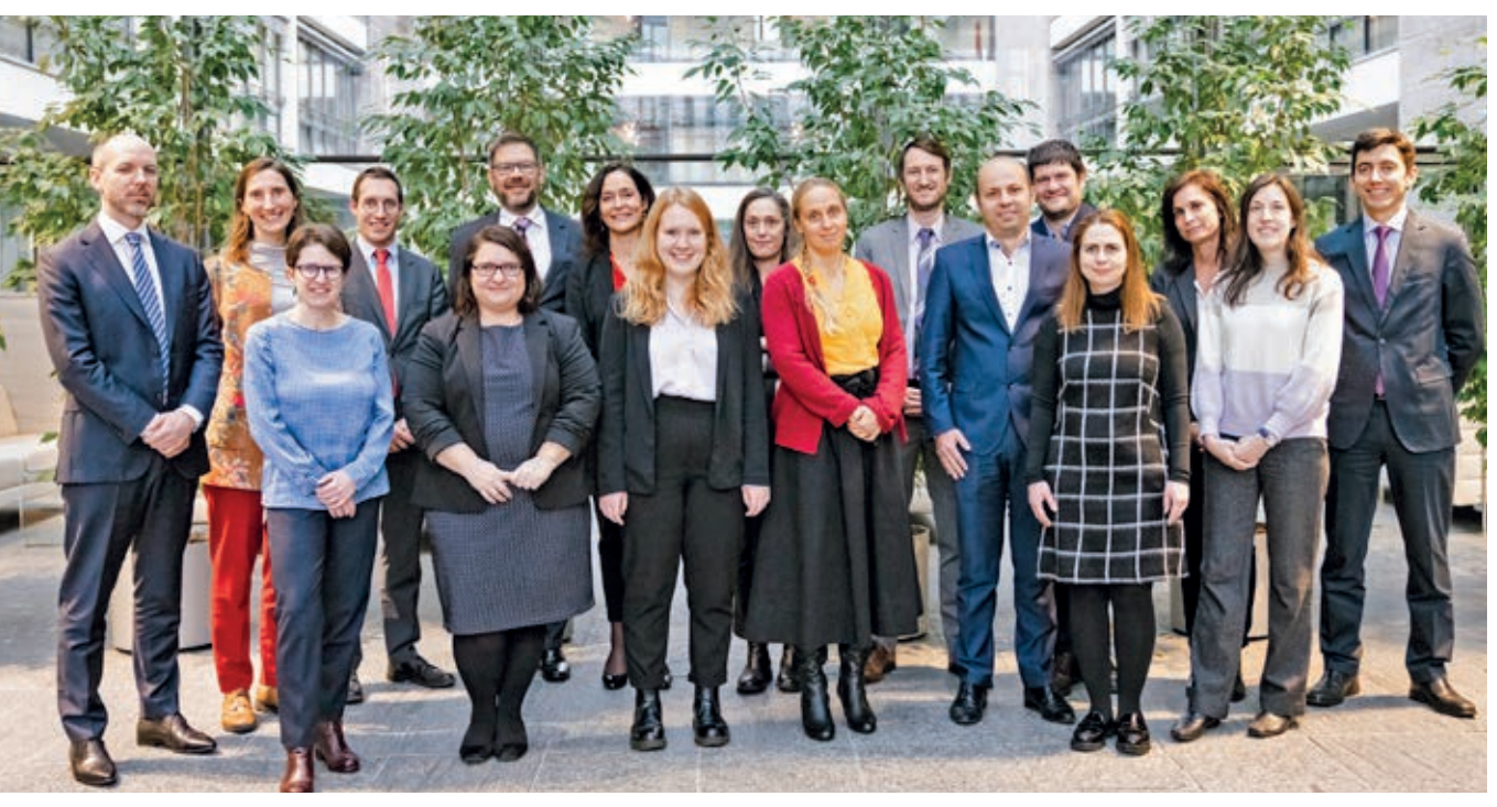
The Evaluation division team, October 2022

Evaluation reports are available from the EIB website: www.eib.org/evaluation.