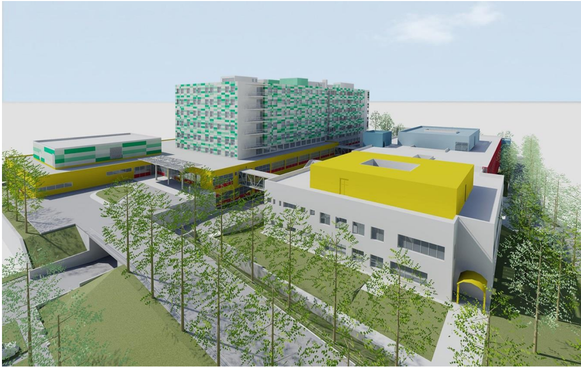
GH Pula - 2018