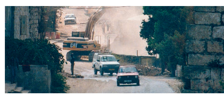
Facility for Euro-Mediterranean Investment and Partnership