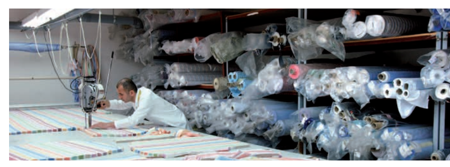
Facility for Euro-Mediterranean Investment and Partnership