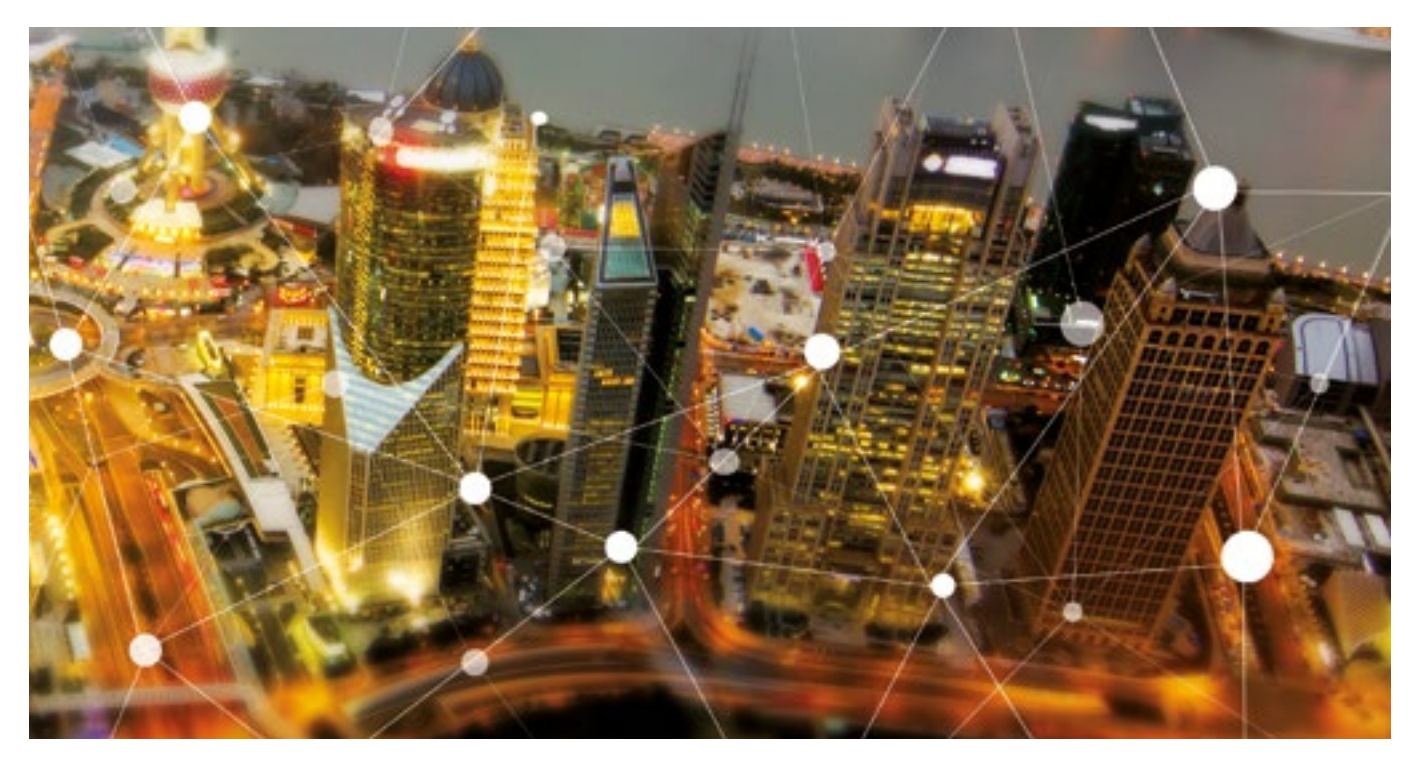
Innovation to combat climate change: new digital technologies for electricity networks (EIB: EUR 32.5m under the Investment Plan for Europe)

Industrial group Velatia benefited from EIB support to improve its energy capacity in 2018. This financing will enable the company to move forward with the automation and digitisation of electricity networks to adapt them to a renewable and distributed energy mix. To this end, it is developing technologies using new electromechanical equipment and innovative distribution network management software.