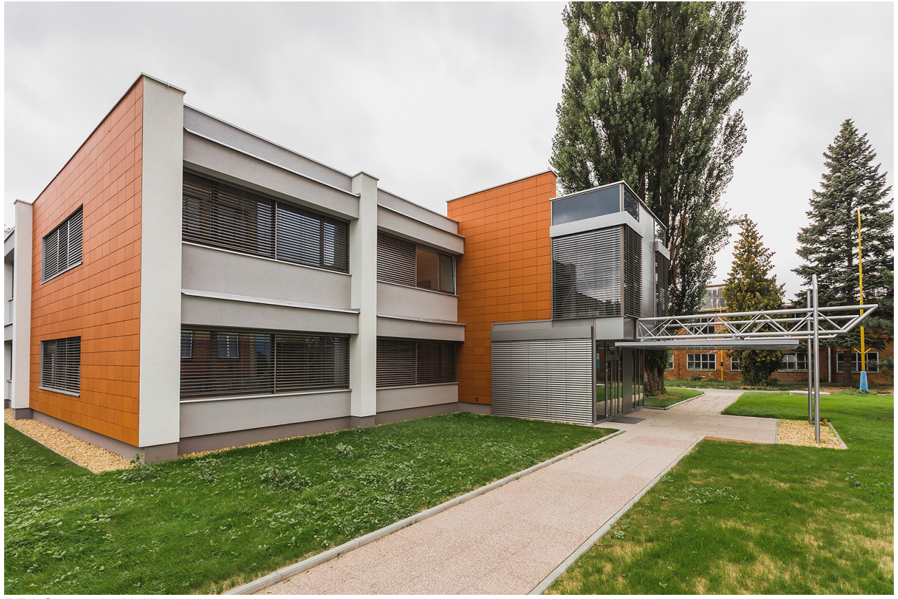
RDI Centre in Kuřim

In 2018, the EIB provided CZK 700m (some EUR 27.4m) to the South Moravian Region to improve infrastructure, help the economy and offer better public services, especially in health and social care. This includes the refurbishment of public buildings, schools and sport facilities, social-care buildings, and measures that will cut energy expenses. This loan cofinances 15 transport, health and social care sub-projects with EU funds amounting to CZK 1.5bn (EUR 59m). This is the third EIB operation granted in the South Moravian Region, bringing the EIB support to the area to some EUR 116m.