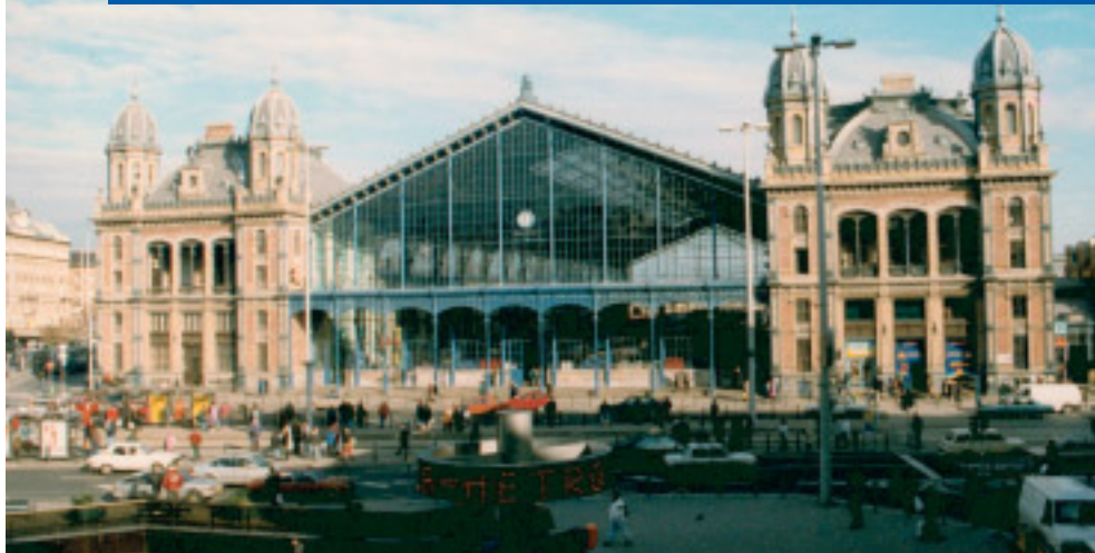
Budapest station, Hungary

The EIB's Operations Evaluation Department (EV) recently issued a report on transport projects in Central and Eastern Europe that have been financed between 1990 and 1999. With the help of independent external consultants, it carried out desk reviews of 25 projects, followed by in-depth analysis, including field investigations, of ten projects in the road, rail and airports sectors. As is true for all ex-post evaluation reports produced by EV, the evaluation had two primary functions. Firstly, to increase transparency both to the EIB's governing bodies and to the outside world and, secondly, to allow the Bank to learn from its experiences.