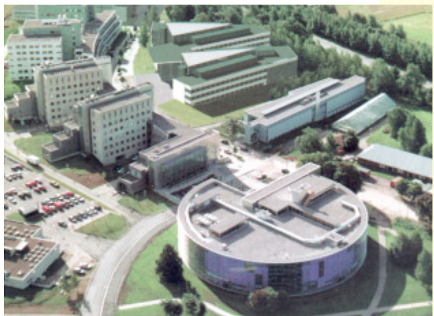
Helsinki Science Park