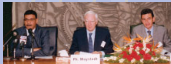
from Left to right, P. Maystadt, EIB President, Dr A. Ebeid, Prime Minister, P. de Fontaine Vive, EIB Vice-President

On 1 and 2 October 2003, EIB President Mr Philippe Maystadt and Mr Philippe de Fontaine Vive, Vice-President in charge of financing operations in the Mediterranean Partner Countries (MPCs), held a series of discussions at the highest level with the Egyptian authorities and officially inaugurated the Bank’s regional office for the Near East in the presence of the Prime Minister, Dr Atef Ebeid. See article page 9.