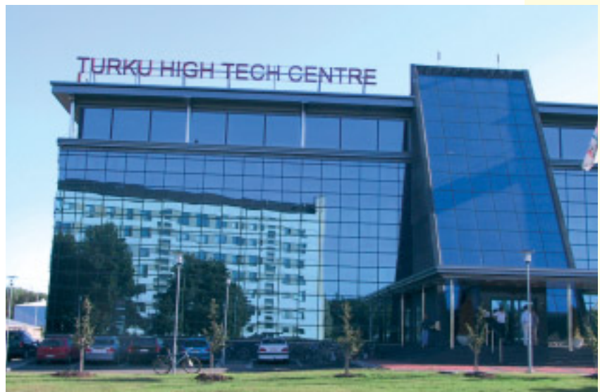
Turku Science Park