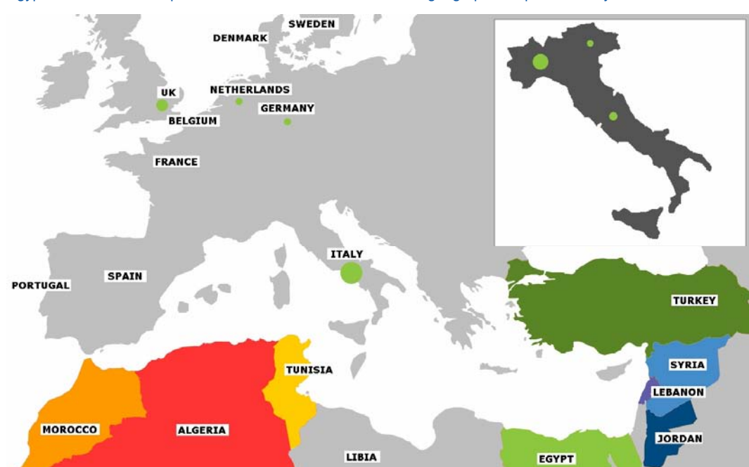
Figure 9.1 Egyptians in the most important EU countries in 2003 and their geographical spread in Italy

Since 1995 the number of Egyptian nationals in Italy has doubled to 41.000 in 2003<sup>116</sup>. Egyptian migrants in Italy are concentrated in the Milan area (Lombardy, 69%) and Lazio (16%).