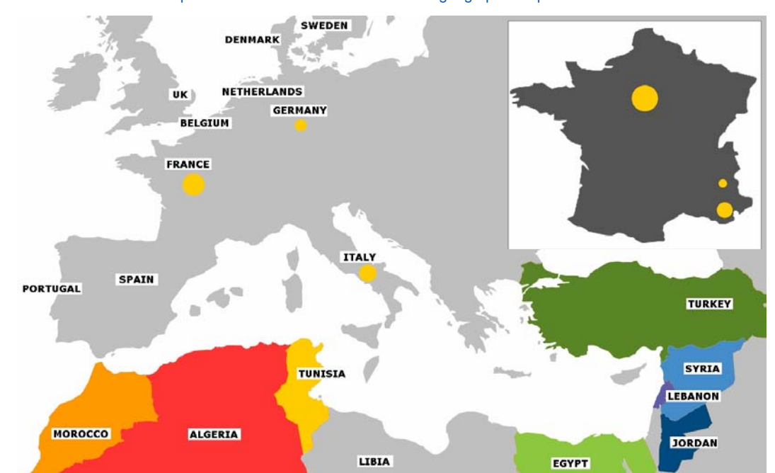
Figure 7.1 Tunisians in the most important EU countries in 2003 and their geographical spread in France