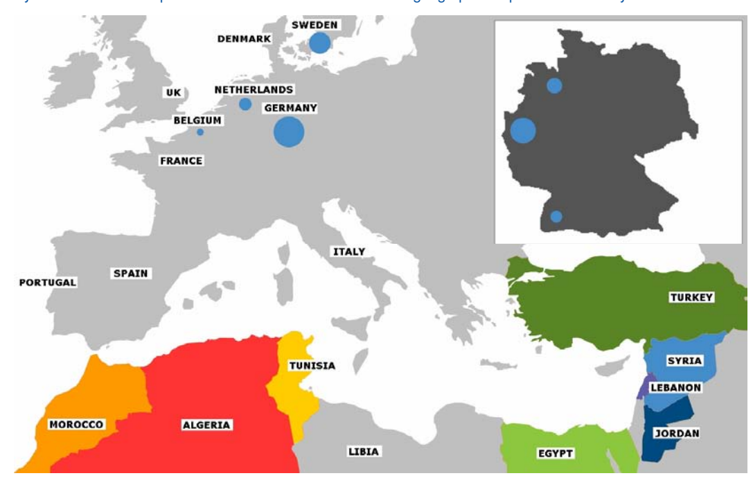
Figure 12.1 Syrians in the most important EU countries in 2003 and their geographical spread in Germany

From the almost 30.000 Syrian immigrants living in Germany, 30% reside in Nordrhein-Westfalen and 20% in Niedersachsen, see table 12.2 and figure 12.1 (insert).