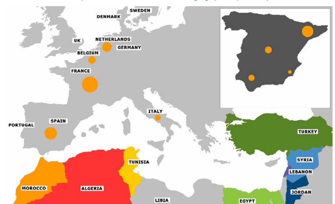
Figure 6.1 Moroccans in the most important EU countries in 2003 and their geographical spread in Spain