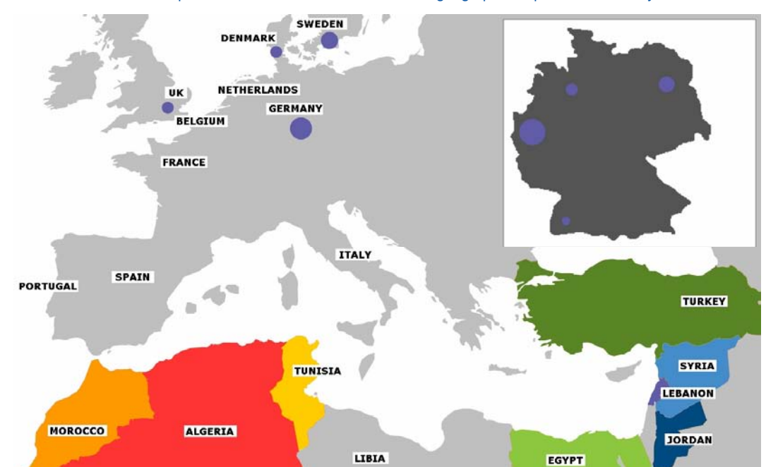
Figure 10.1 Lebanese in the most important EU countries in 2003 and their geographical spread in Germany