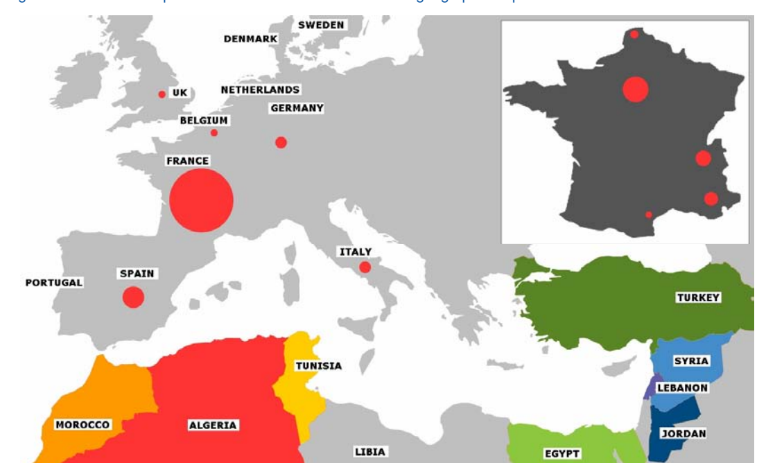
Figure 8.1 Algerians in the most important EU countries in 2003 and their geographical spread in France.