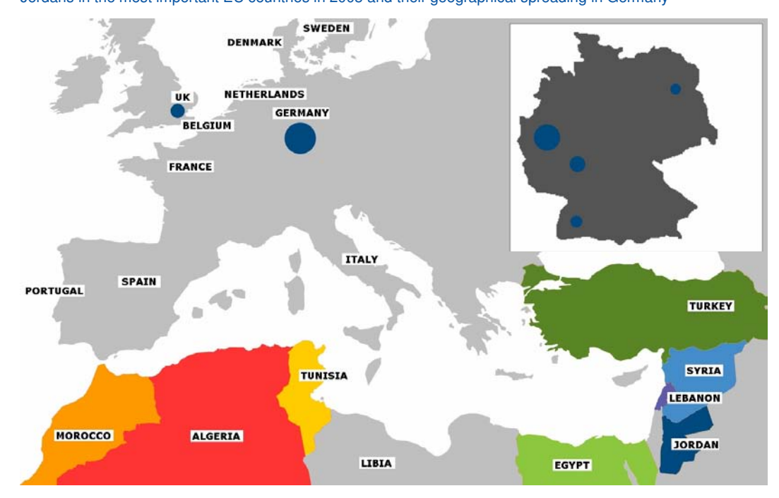
Figure 11.1 Jordans in the most important EU countries in 2003 and their geographical spreading in Germany

In Germany the number of Jordanian immigrants is decreasing from 12.500 in 1995 to 8.500 in 2004. They are concentrated mainly in Nordrhein-Westfalen (2.065 or 24%), Hessen (1.511), Baden-Wurttemberg (1.212) and Berlin (1.206). See insert in figure 11.1.